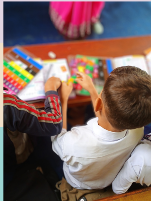
Maths Follow Up

was orientation for the Literature Festival and Maths Exhibition that will take place at the end of the Nepali academic year. There were parent seminars and scholarships were distributed to all partner schools.