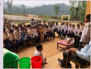
Environment Day Celebration

World Environment Day was celebrated in each school through trash collection and awareness led by Child Clubs. Trainers were busy with Maths, Science, Phonics, English, ECD, and Classroom Management sessions conducted. PE kits were also distributed and the school lunch program began.